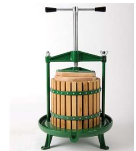
12L cross-beam press